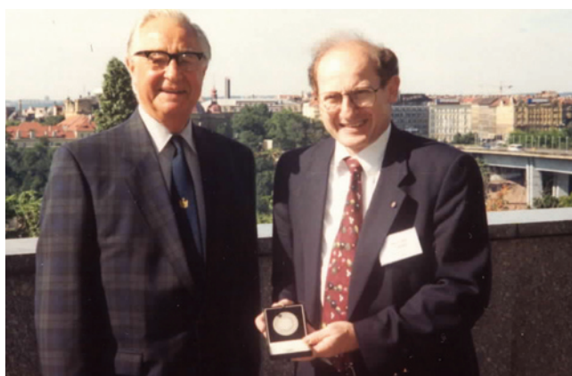
George Porter and Nick Turro at the 1994 IUPAC Symposium on Photochemistry in Prague when Nick received the Porter Medal.

Trozzolo: The topics in the invited talks included: photochemistry of carbonyl compounds, photoisomerizations, photochromism, photolysis of hydrocarbons, epr of triplet ground-state molecules, photoreactions of olefins catalyzed by pi-complexes, charge-transfer in excited states, photocleavage of episulfides, and quenching mechanisms (electron transfer vs. energy transfer). The discussion periods always seemed to go overtime. This was a time for us to get to know each other and to find out what other interesting systems were being studied and what mechanistic concepts were being applied or in need of refinement. My guess is that the impact of the conference was really felt only after we returned to our respective institutions and had time to savor what had transpired in the week at Tilton School.