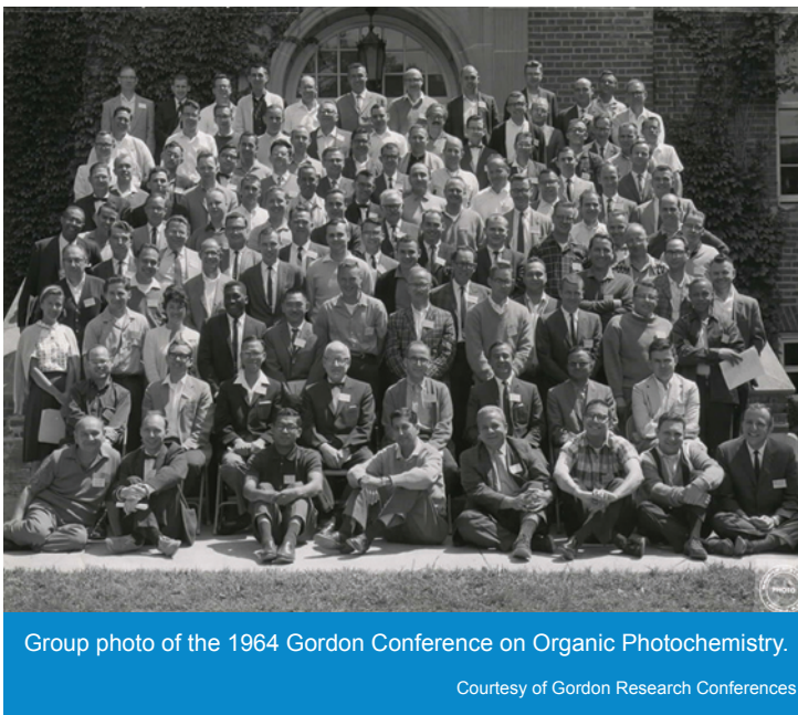
Group photo of the 1964 Gordon Conference on Organic Photochemistry.

The Spectrum: What did they discuss, what ideas emerged, what do you recall most about the sessions?